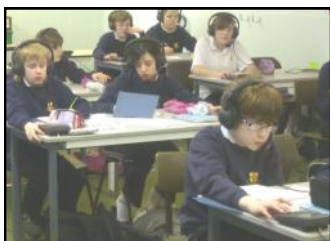
Year 7 German students using the Language Lab

The Language Lab has been a great success so far. Most classes are in there at least once every two weeks (we have made some swaps in order to prioritise Year 10 and Year 11 classes as they prepare for their controlled speaking assessments this term), and all classes have thoroughly enjoyed using it.