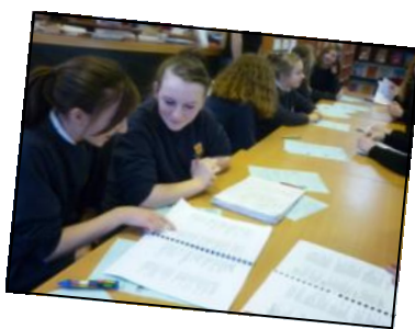
Millthorpe students meet the French visitors from Calais