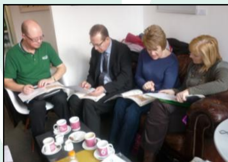
Adult French class at the Bar Lane Studios