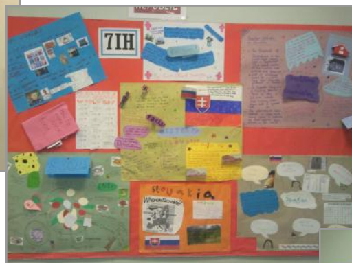
The winning displays

their adopted country. Students Geography, History, Religion, Traditions and Celebrations, Famous People, Food and Language. Expertise was provided through the knowledgeable staff of the Languages and RE departments!