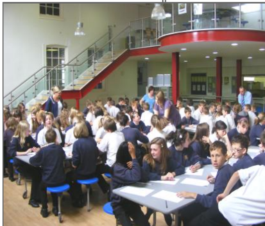
Year 7 Students enjoying a 'Beetle Drive' in their Maths lesson at the end of term.

Open Day at York Hospital, Wigginton Road on Tuesday 14 September 2.30-5.30pm