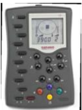
A Digital Recorder Unit

New Language Lab! - Over Easter, engineers from SANAKO came into school and fitted brand new digital equipment into the Language Lab, replacing the old cassette-based system that had been in use for many years. The new Language Lab (called Lab 100) is controlled by a single computer, which operates both the Media Storage Unit (for storing pupils' work) and the Digital Recorder Units, which are controlled by pupils. They are easy to operate, and allow the pupils to participate in a number of stimulating learning activities, either alone, in groups or in pairs. The new Lab has many features which were not available previously - here are just a few of the features available: