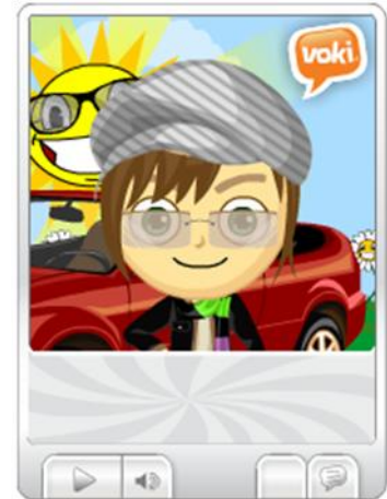
An example of a Voki avatar made by a member of Blogging Club

We started out by making Vokis (talking avatars, available for free at www.voki.com ), with the club members finding it most amusing having something that they could make say whatever they wanted! We then moved on and spent a couple of weeks making cartoon strips using Toondoo ( www.toondoo.com ).