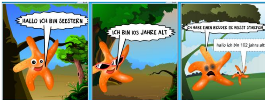
An example of a Toondoo comic strip made by a member of Blogging Club