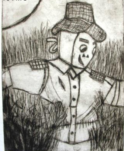
Dry point by Sophie Soanes, 10VMC