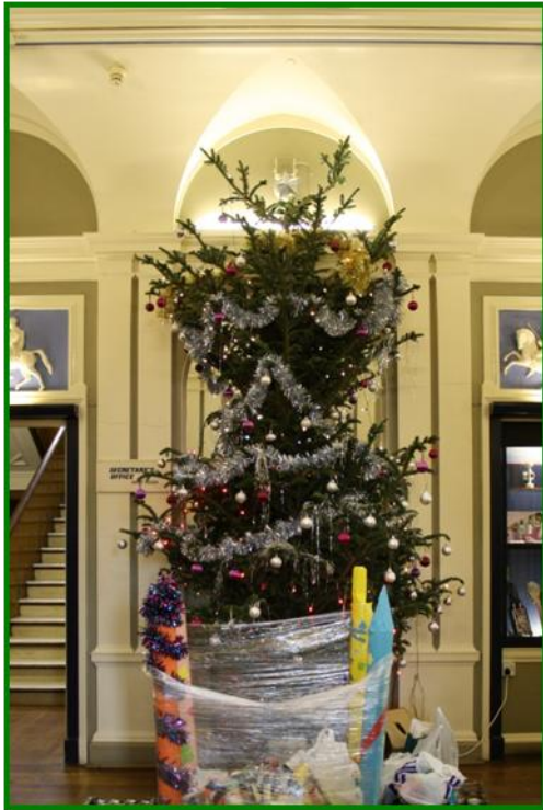
Our Millthorpe Christmas Tree — almost as big as the Tate Modern tree but much more decorative!