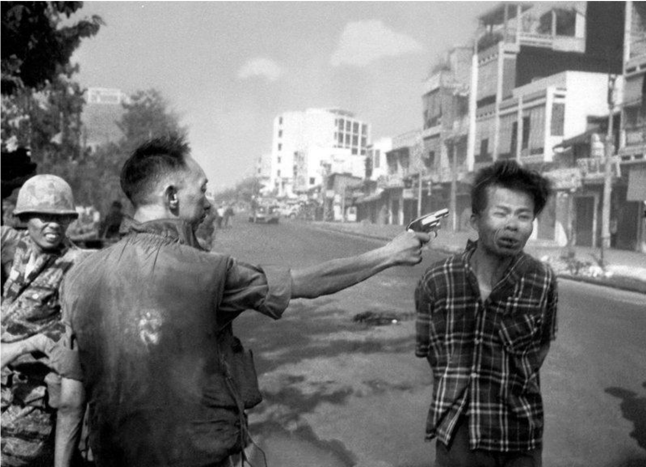
Chief of Police in Saigon executes a Vietcong suspect, 1968